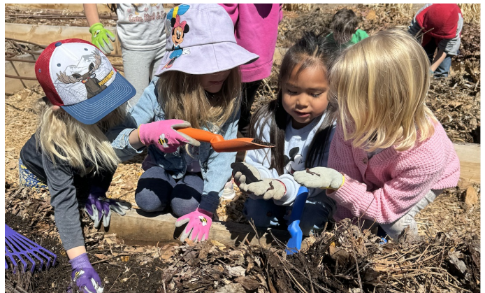
Kindergarteners learning what is inside the "secret world of soil"

This year, all Durango 9R teachers are invited to schedule a field trip to the SOIL Community Garden. Last school year SOIL staff hosted field trips for over 1,800 9R students with plans to serve even more this year!